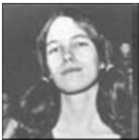
Leslie Van Houten