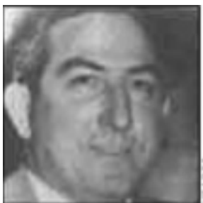
Victim Leno LaBianca

Instead he got four bullets from a .22 caliber revolver.