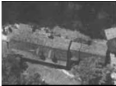
The Tate/Polanski House on Cielo Drive

A private security guard hired by some of the wealthy property owners thought he heard several gunshots a little after 4 A.M. and called his headquarters. Headquarters, in turn, called Los Angeles Police Department to report the disturbance. The LAPD officer said: "I hope we don't have a murder; we just had a woman-screaming call in that area."