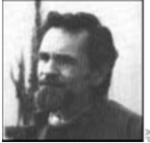
An older Manson

Manson endures, even as a sixty-year old, comparatively passive prisoner, unlikely to ever be paroled. Bugliosi sums up the continued fascination with the more fanatical elements of society: "Today, almost every disaffected and morally twisted group in America, from Satanists to neo-Nazi skinheads, has embraced Manson and the poisons of his virulent philosophy. He has become their spiritual icon, the high priest of anti-establishment hatred."