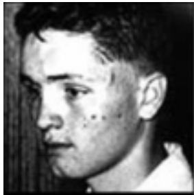
Charles Manson at 14