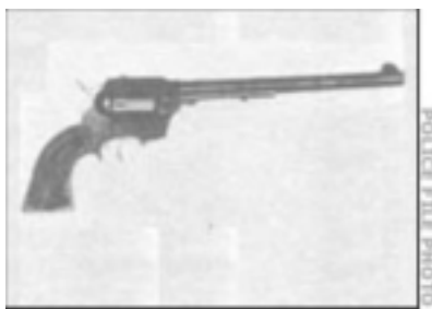
.22 caliber Longhorn revolver

A couple of weeks earlier, the LAPD forensics experts determined that the .22 caliber revolver with the broken grip used on the Tate victims was none other than a Hi Standard .22 caliber Longhorn revolver, which was relatively unique and rare. Amazingly enough, two weeks later, an identical gun with a broken grip is turned in to the LAPD, tagged, filed away and completely forgotten.