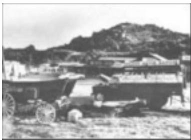
The Spahn Ranch

Three months after the murders, which had been separately pursued by the LAPD and the LA Sheriff's Office, neither group had made any progress. However, the detectives working for the Sheriff's Office were younger and more aggressive than their LAPD counterparts and came to the conclusion that the Tate and LaBianca cases were definitely connected. They had several suspects, one of which was Charles Manson.