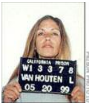
Leslie Van Houten

Is currently a prisoner at the California Institution for Women, Frontera.