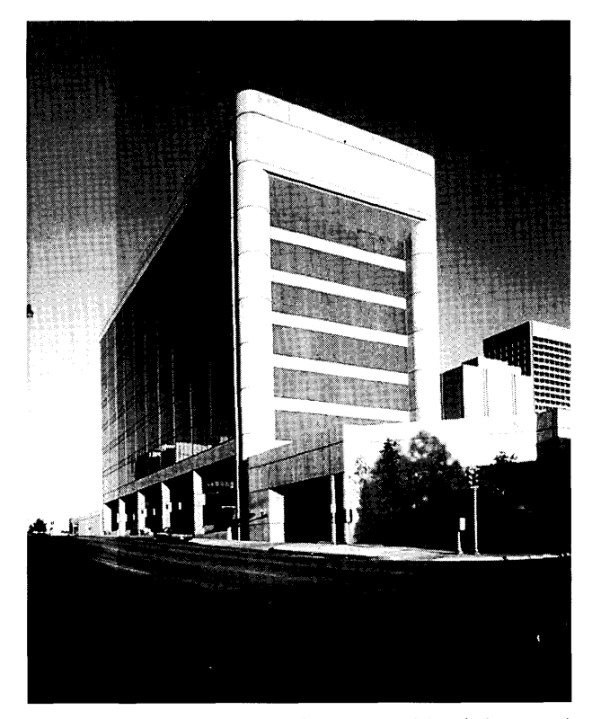
This photograph, taken shortly after the completion of the Alfred P. Murrah Federal Building, shows the north side of this award-winning structure.

remaining stories reached to the north property line on NW 5th Street. At the west end of the building was a one-story enclosed loading dock. A one-story windowless extension on the east end provided additional office space for the Social Security Administration. Exterior access to this area was from a door on Robinson. The Murrah Building's main entrance was on the south or plaza side and gave entry to the second floor. The rear entrance was on NW 5th Street and opened to the first floor.