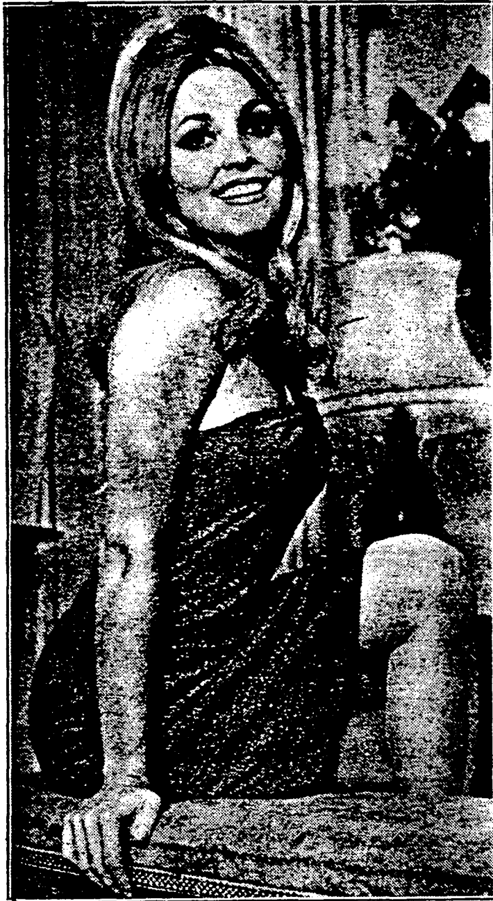
Sharon Tate—police have almost no clues in her death