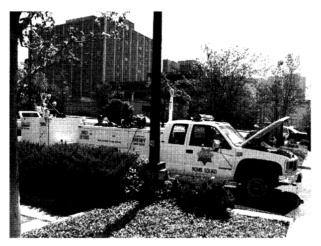
An Oklahoma County Sheriff Bomb Squad unit awaits orders to retrieve what was believed to be a secondary explosive device. Although evacuation orders were given twice as a precaution, no more explosive devices were discovered in or around the Murrah Building.

Oklahoma City's 15 area hospitals and the medical community were prepared to receive and treat the wounded. Hundreds of doctors and nurses from every medical specialty reported to the emergency rooms. Many came to St. Anthony, the hospital nearest downtown, and to the complex of hospitals on NE 13th Street. Medical personnel stood outside the emergency entrances. Lines of attendants with gurneys and wheelchairs were ready to transfer the wounded from the cars and ambulances. Trauma specialists assessed the wounded and called out the type of care needed. Teams with the required medical skills came forward to receive and treat the patients. The hospitals attempted to get as much identification information as possible