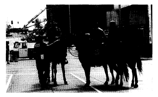
Members of the Oklahoma City Police Department and County Sheriff's Department remain at their posts to maintain the security of the crime scene after the evacuation order.

Once the evacuation was complete, Oklahoma City Police, Oklahoma Highway Patrol, and Oklahoma County Sheriff Bomb Squads entered the building along with special canine units. They searched for a suitcase or any possible explosive. They did not find a suitcase. The all clear was given at 11:22 a.m.