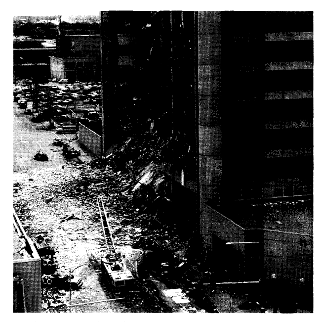
Truck 8 is removed from the north side of the Murrah Building after the evacuation order. A triage area lies in the street, deserted by the medical personnel ordered to leave a few minutes ago. The crater is visible near the tip of the ladder.