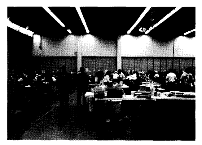
The Oklahoma Restaurant Association provided thousands of meals to rescue workers and volunteers, both here at the Myriad and at the Murrah site.

Animal Welfare Division workers participated in the rescue work and assisted law enforcement officers in establishing the perimeter. The General Services Director ordered crews to check City buildings for damage. Will Rogers World Airport went to Security Level No. 1. Airport maintenance personnel swept the terminal and the parking lot for any suspicious objects. Line departments not already involved at the site estimated the personnel and equipment they might need to provide. Parks Department employees took first aid